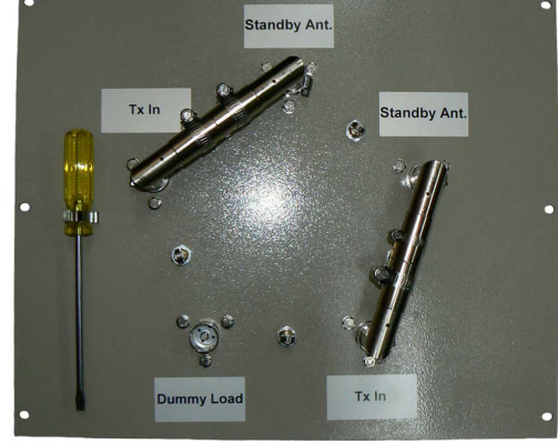
Front face of panel with indication stickers and screw driver