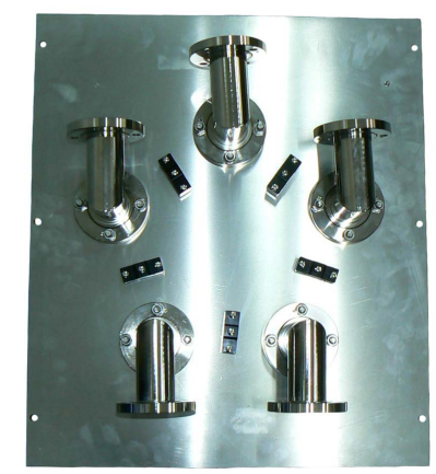
Rear of panel with 5 x 1-5/8" EIA flanged terminations