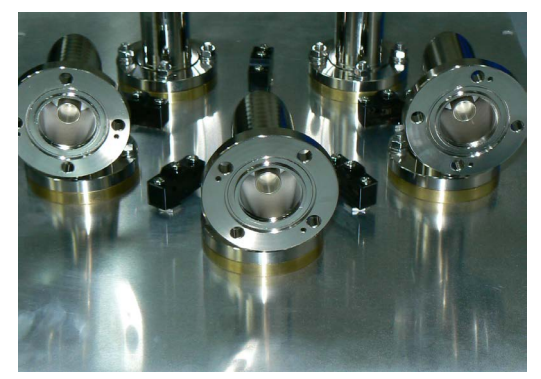
1-5/8" EIA flange connectors on rear of panel. Can be rotated to suit feeder line routing.