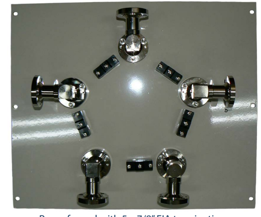
Rear of panel with 5 x 7/8" EIA terminations