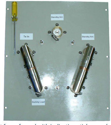
Front face of panel with indication stickers and screw